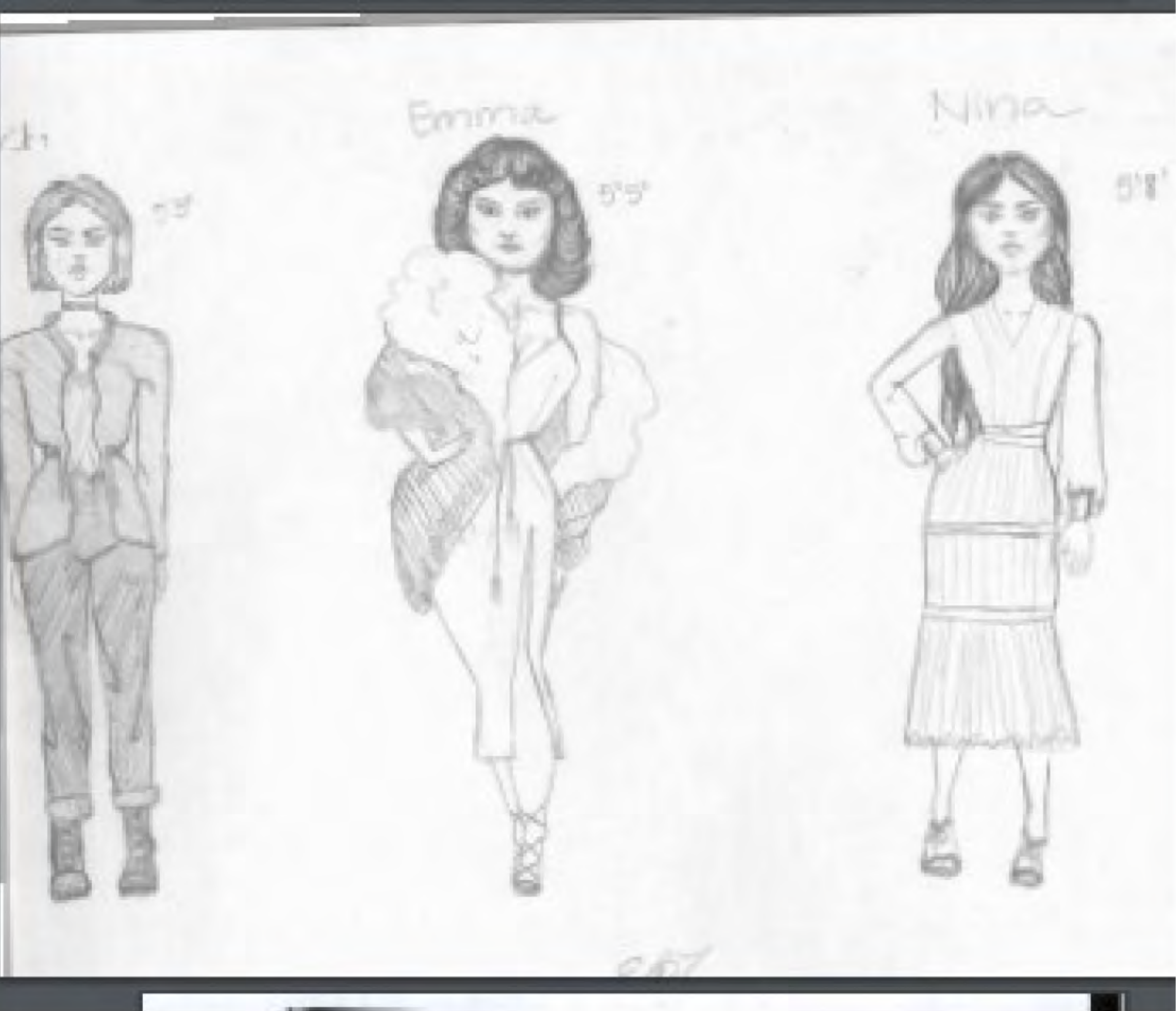
Example of Costume Design (above)