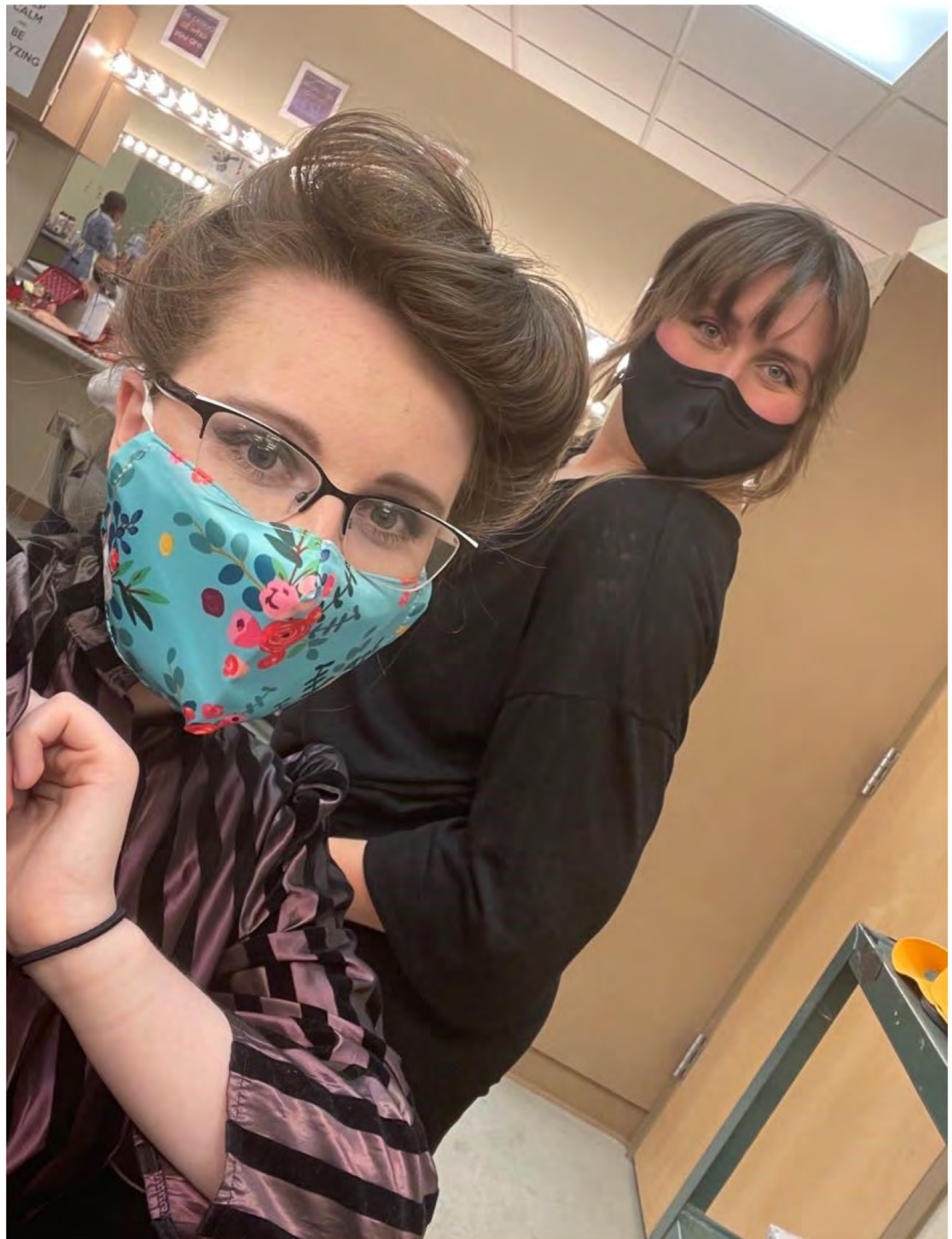
Example of Hair (below)