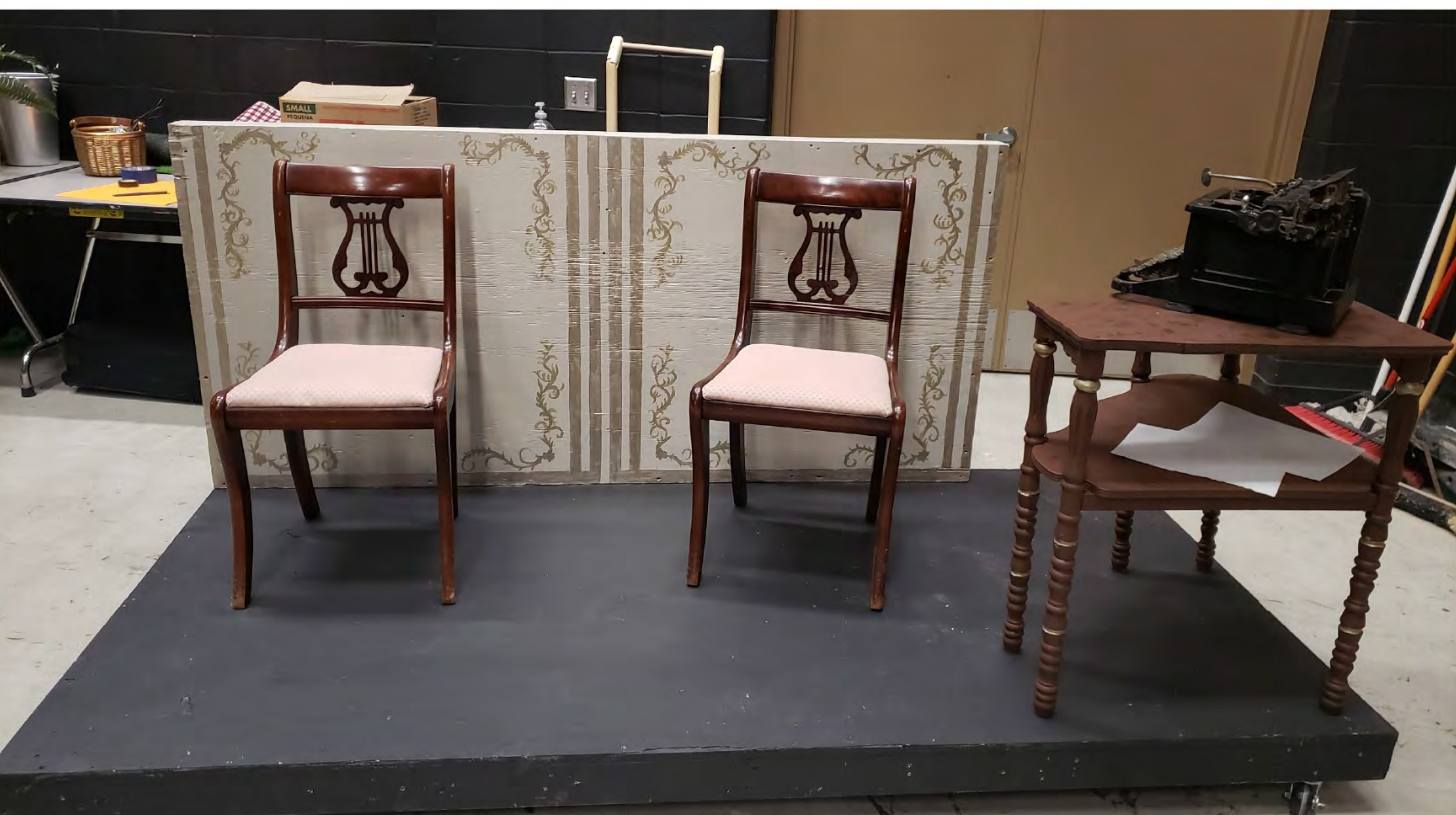
Example of Scenic Painting (above)